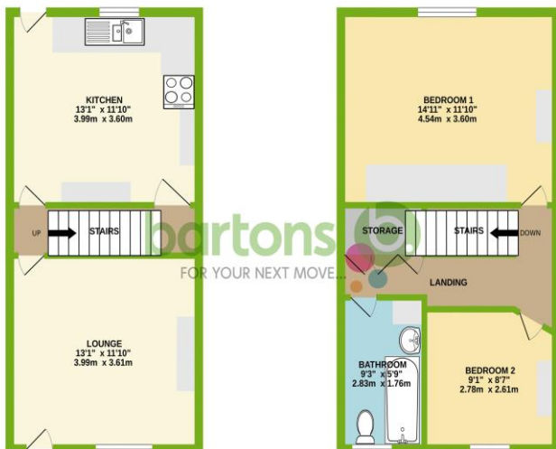
1ST FLOOR 398 sq. ft. (37.0 sq. m.) approx.

TOTAL FLOOR AREA: 748 sq. ft. (69.5 sq. m.) approx.