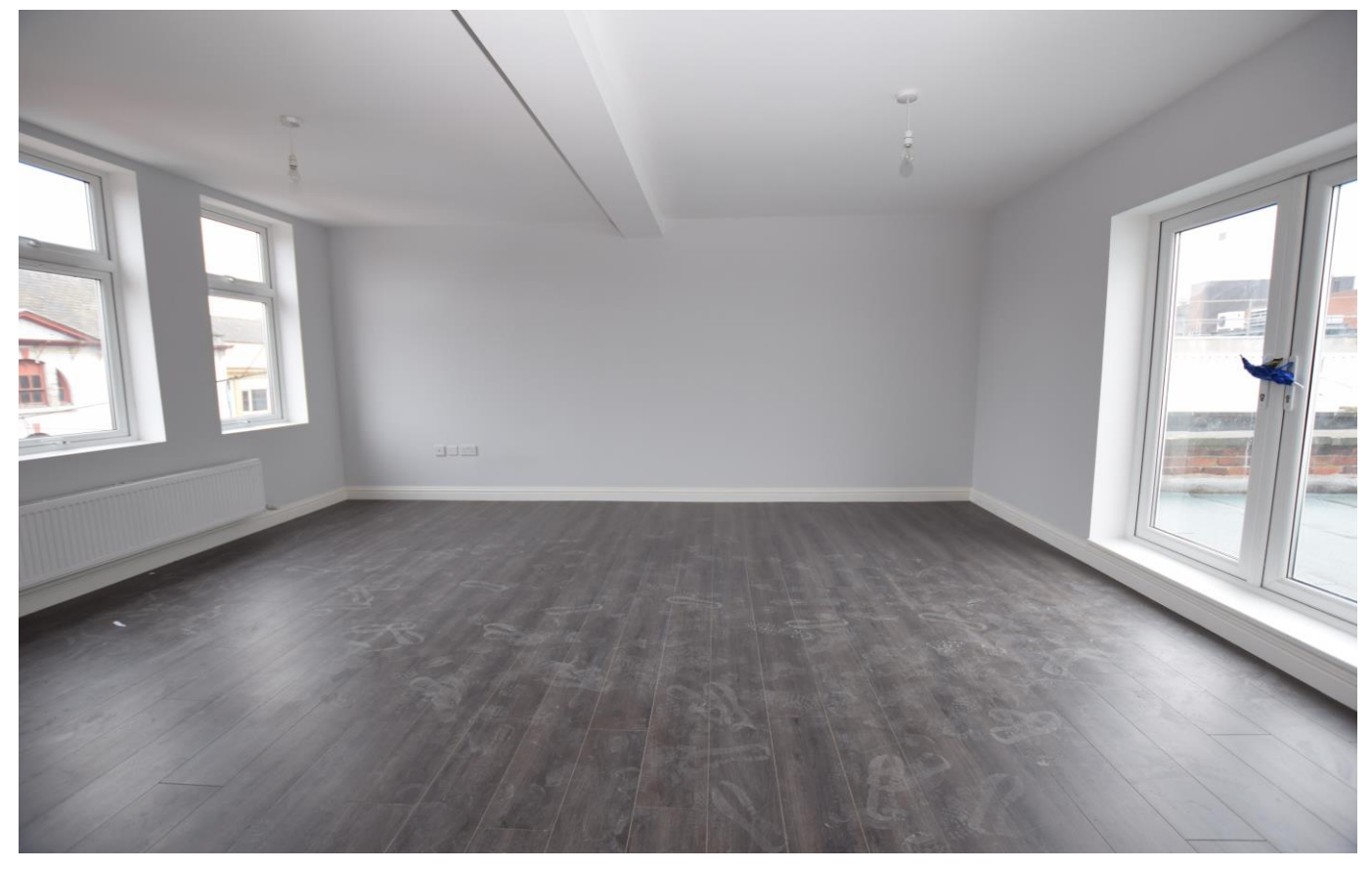
10-14 Bridgegate Rotherham S60 1PQ Rent per Month £500