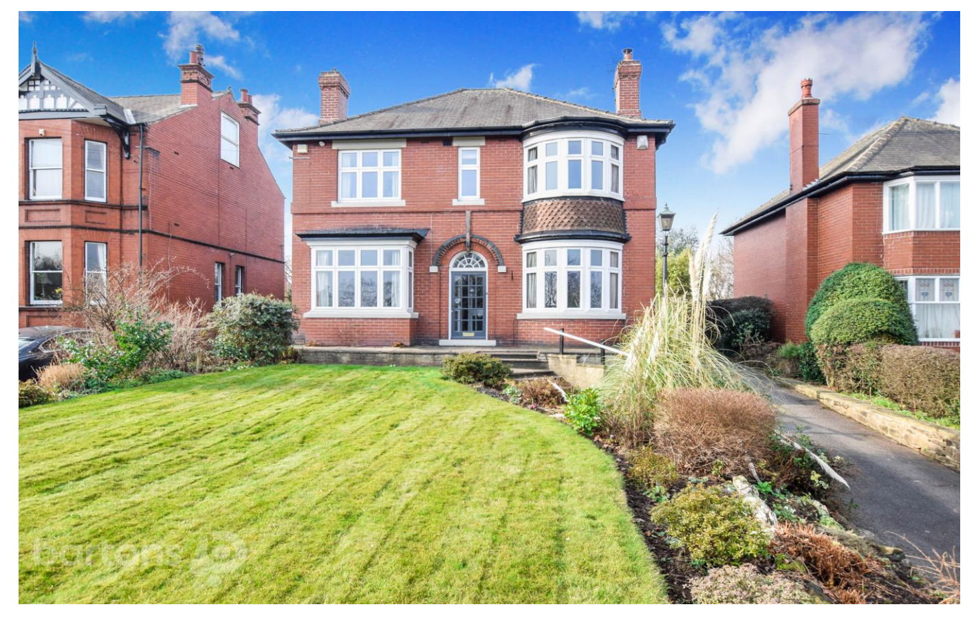
Broom Lane Broom Rotherham S60 3EL £490,000