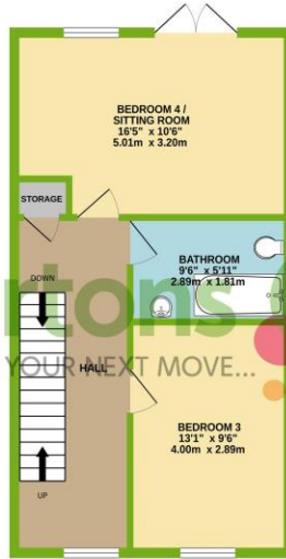
UPPER GROUND FLOOR 495 sq.ft. (45.1 sq.m.) approx.