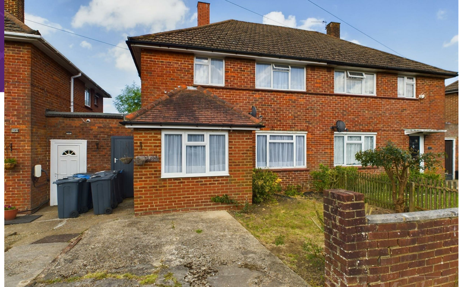
EST 1973 Paul Meakin ESTATE AGENTS Offers In Excess Of £400,000 Kennelwood Crescent, New Addington, CR0 0DQ