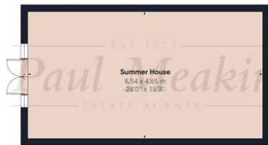
Ground Floor Building 2

£525,000 Abbey Road, South Croydon, CR2 8NJ