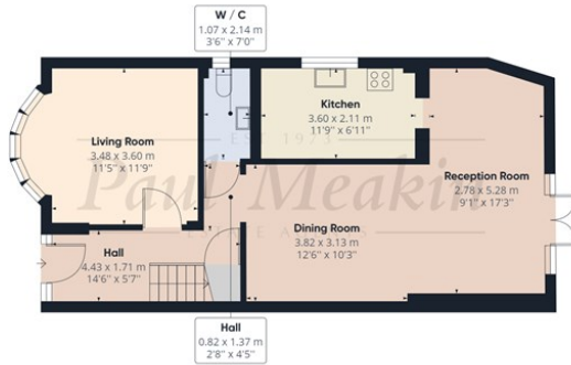
Ground Floor Building 1