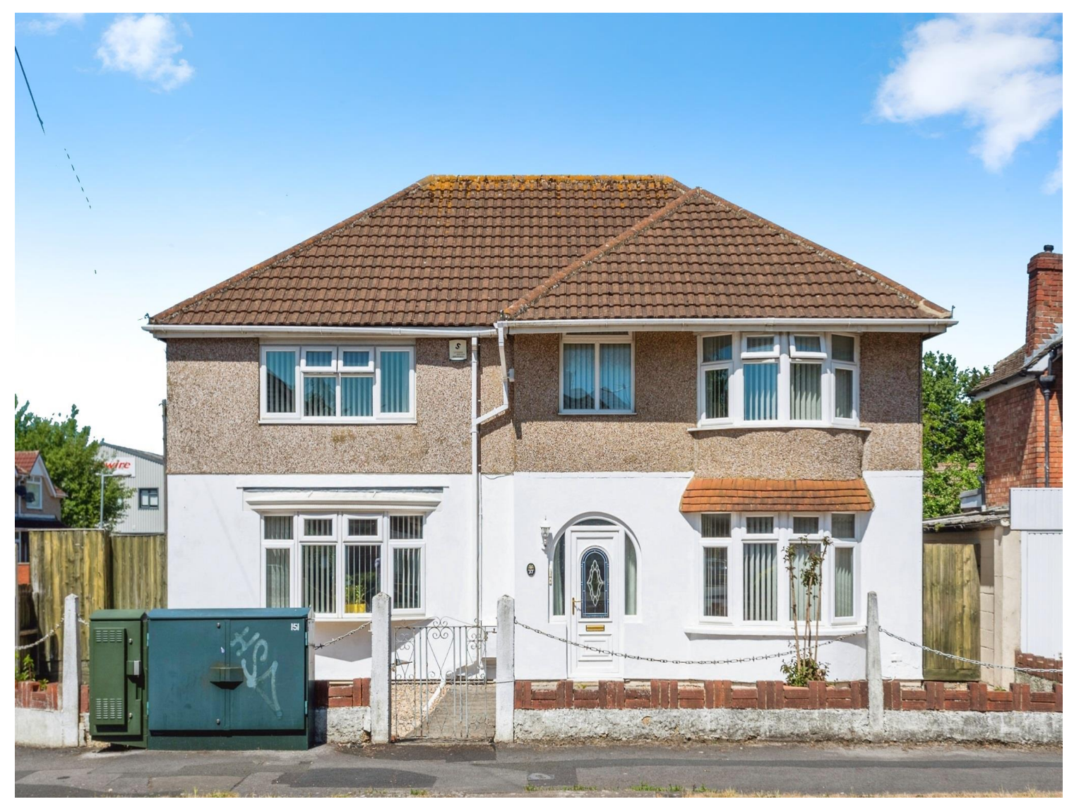
Headlands Grove Swindon SN2 7HS

Situated in the sought-after location of UPPER STRATTON this impressive FOUR BEDROOM DETACHED HOME offers generous living space and a versatile layout. Spacious garden with planting beds. DOUBLE GARAGE. with DRIVEWAY PARKING