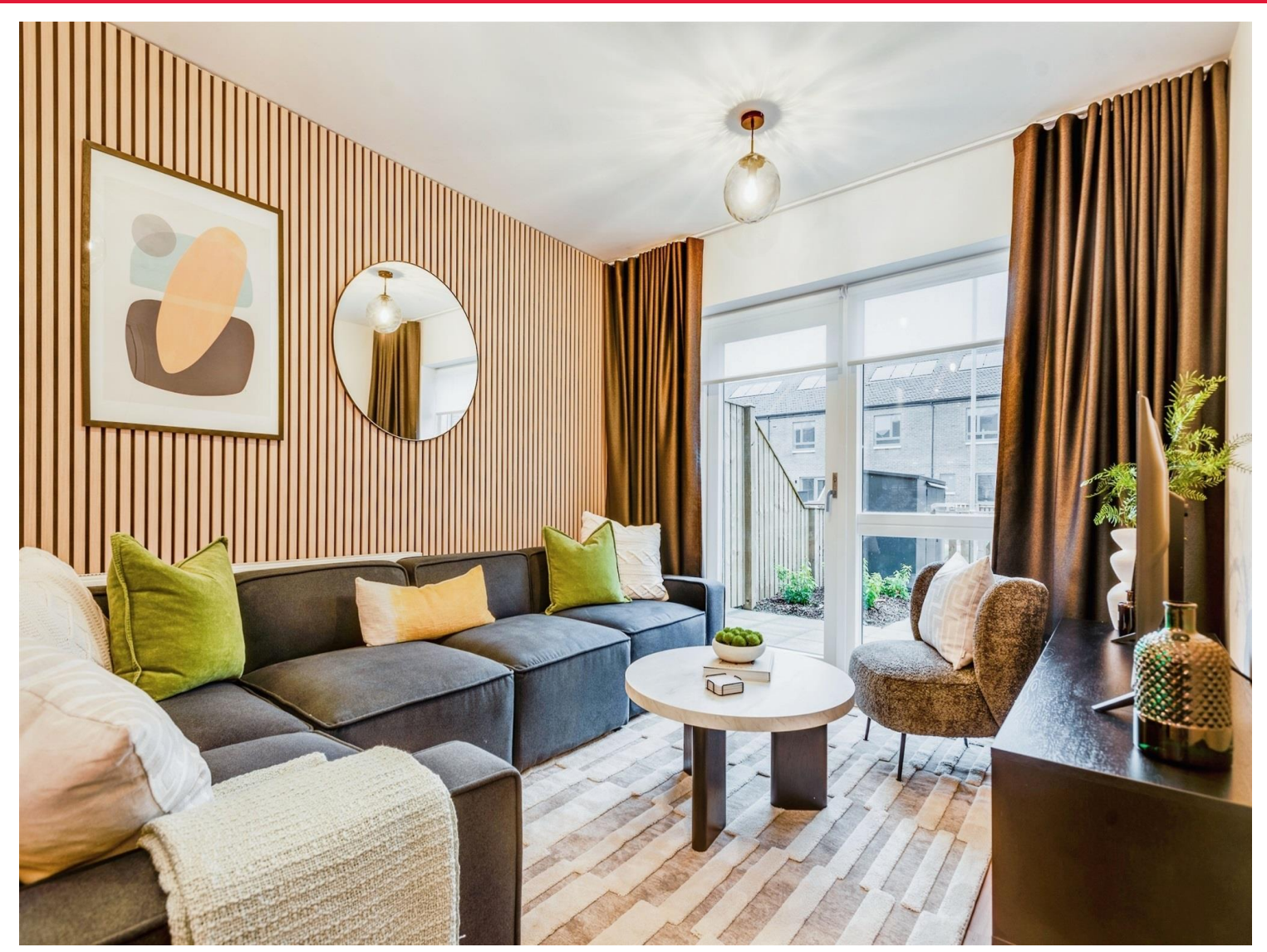
The Cedar Oakfield Swindon SN3 3HQ

Wonderful Brand New family home at Oakfield by Nationwide. 5% deposit contributions. The Cedar From £310,000. Call us today to book in for a viewing! 01793708050!! Click Here For More Information!