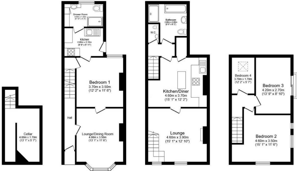
Cellar Floor area 11.5 sq.m. (124 sq.ft.)