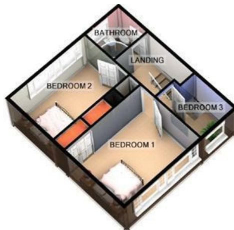
1ST FLOOR APPROX. FLOOR AREA 446 SQ.FT. (41.4 SQ.M.)