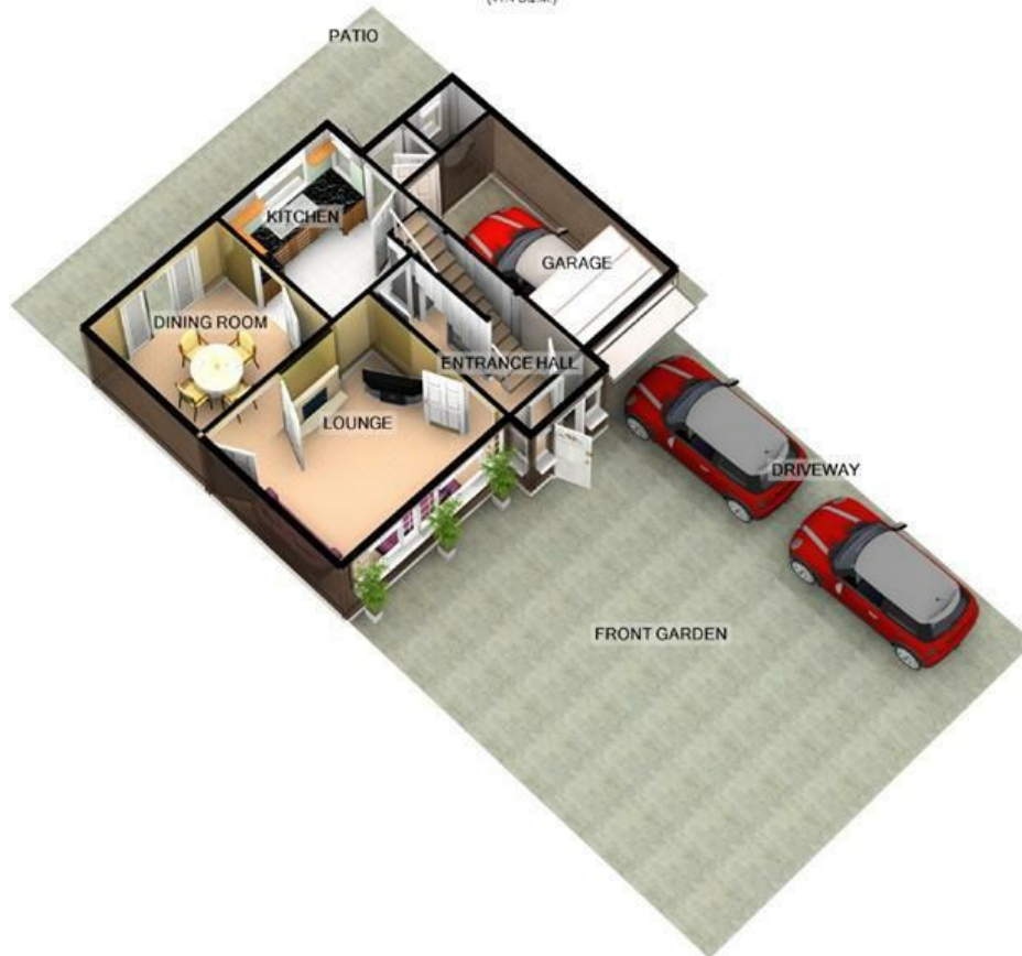
GROUND FLOOR APPROX. FLOOR AREA 609 SQ.FT. (56.6 SQ.M.)

TOTAL APPROX. FLOOR AREA 1055 SQ.FT. (98.0 SQ.M.)