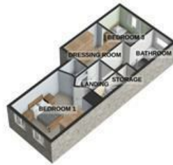
2ND FLOOR 120 sq.ft. (11.2 sq.m.) approx.