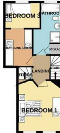
1ST FLOOR 423 sq ft. (39.3 sq.m.) approx.