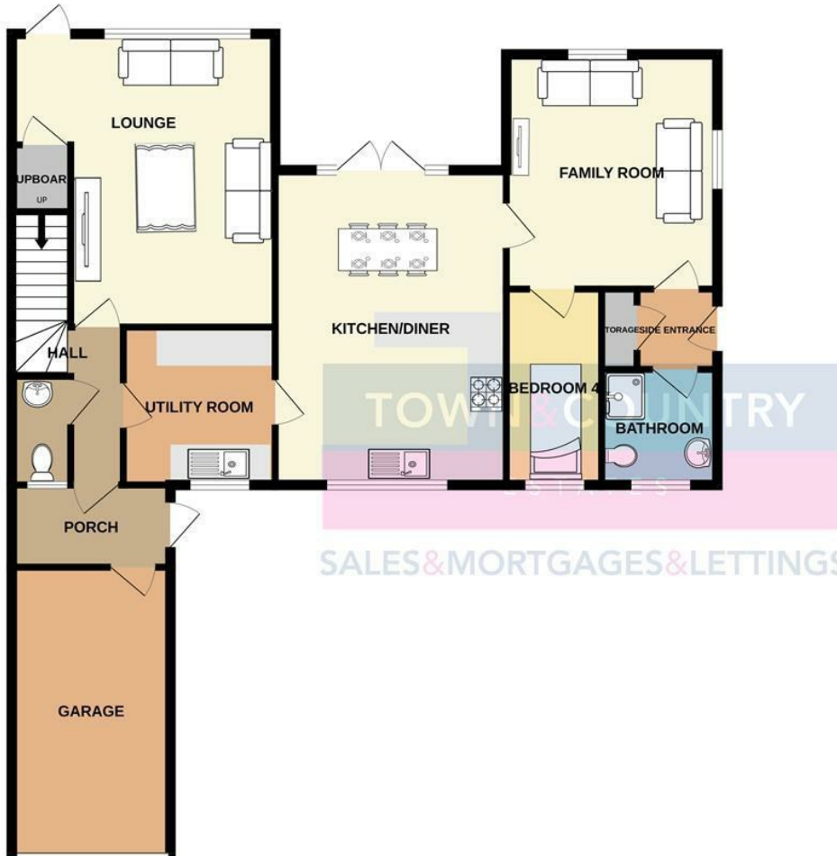
GROUND FLOOR 1071 sq.ft. (99.5 sq.m.) approx.