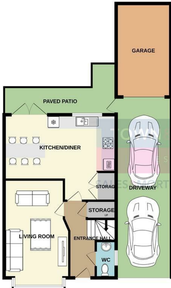
GROUND FLOOR 703 sq.ft. (65.3 sq.m.) approx.