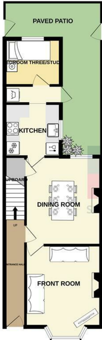
GROUND FLOOR 509 sq.ft. (47.3 sq.m.) approx.