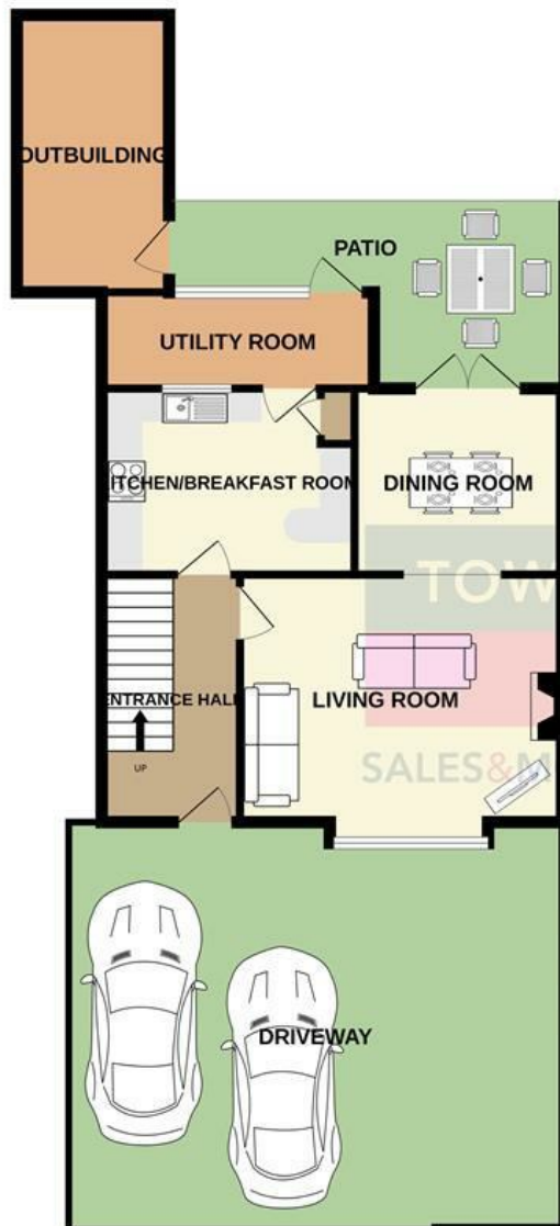
GROUND FLOOR 609 sq.ft. (56.6 sq.m.) approx.