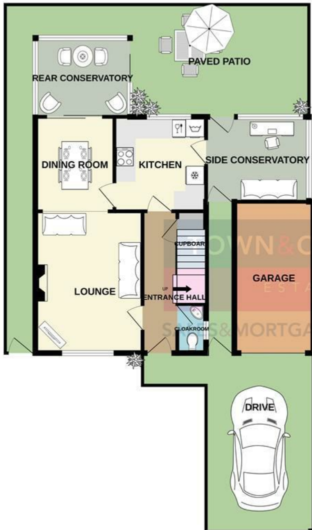
GROUND FLOOR 742 sq.ft. (68.9 sq.m.) approx.