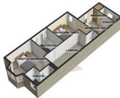
2ND FLOOR 284 sq. ft. (26.4 sq.m.) approx.