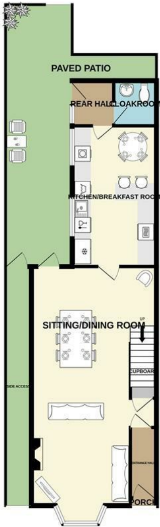
GROUND FLOOR 640 sq.ft. (59.4 sq.m.) approx.