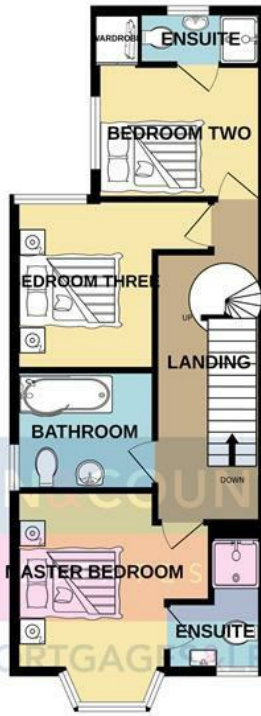
1ST FLOOR 535 sq.ft. (49.7 sq.m.) approx.