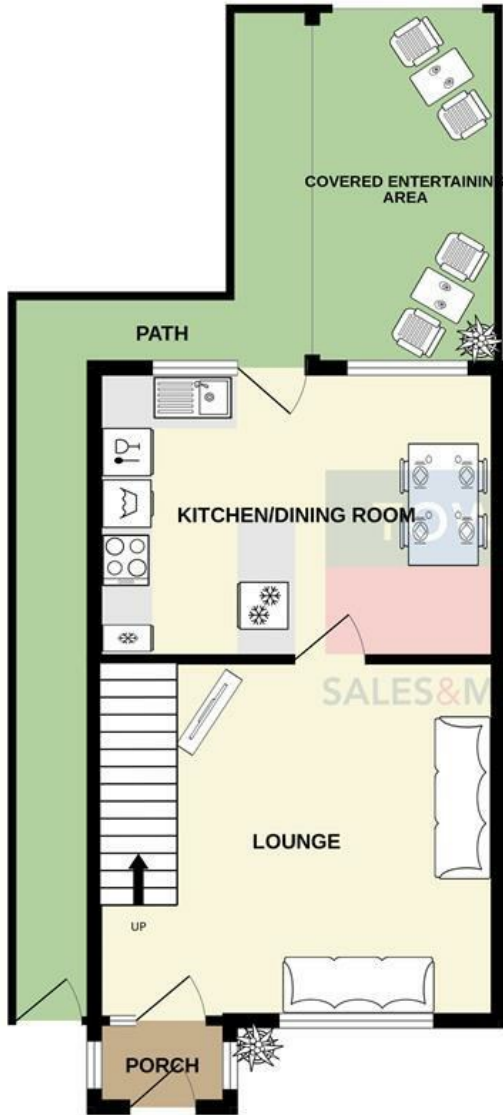
GROUND FLOOR 399 sq.ft. (37.1 sq.m.) approx.