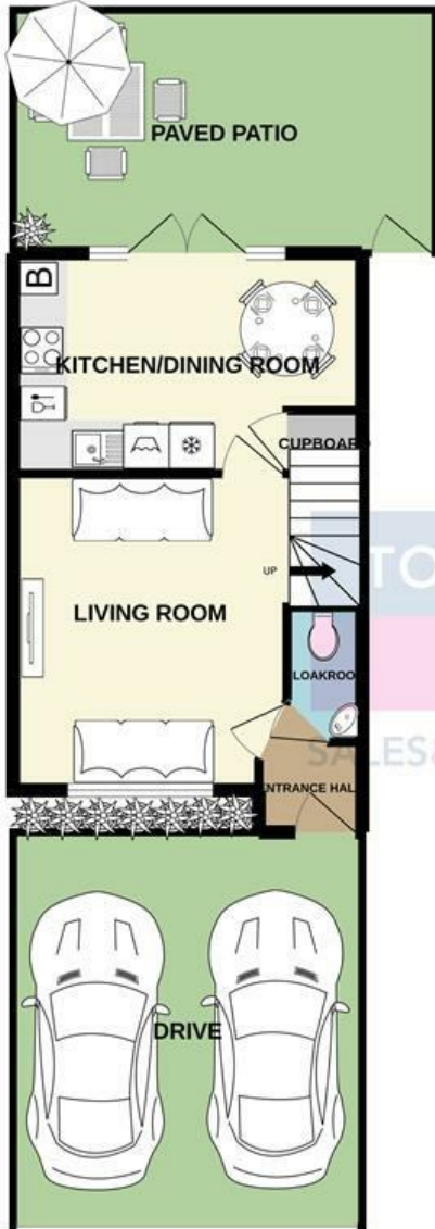
GROUND FLOOR 333 sq.ft. (30.9 sq.m.) approx.