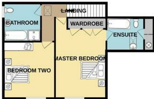
TOTAL FLOOR AREA: 2009 sq.ft. (186.6 sq.m.) approx.

Whilst every attempt has been made to ensure the accuracy of the floorplan contained here, measurements of doors, windows, rooms and any other items are approximate and no responsibility is taken for any error, omission or mis-statement. This plan is for illustrative purposes only and should be used as such by any prospective purchaser. The services, systems and appliances shown have not been tested and no guarantee as to their operability or efficiency can be given. Made with Metropix ©2023