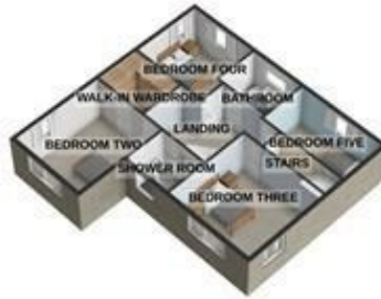
2ND FLOOR 357 sq.ft. (33.2 sq.m.) approx.