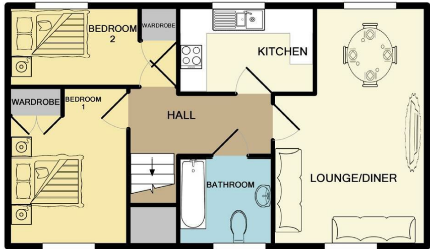
1ST FLOOR APPROX. FLOOR AREA 52.5 SQ.M. (566 SQ.FT.)

TOTAL APPROX. FLOOR AREA 75.6 SQ.M. (814 SQ.FT.)