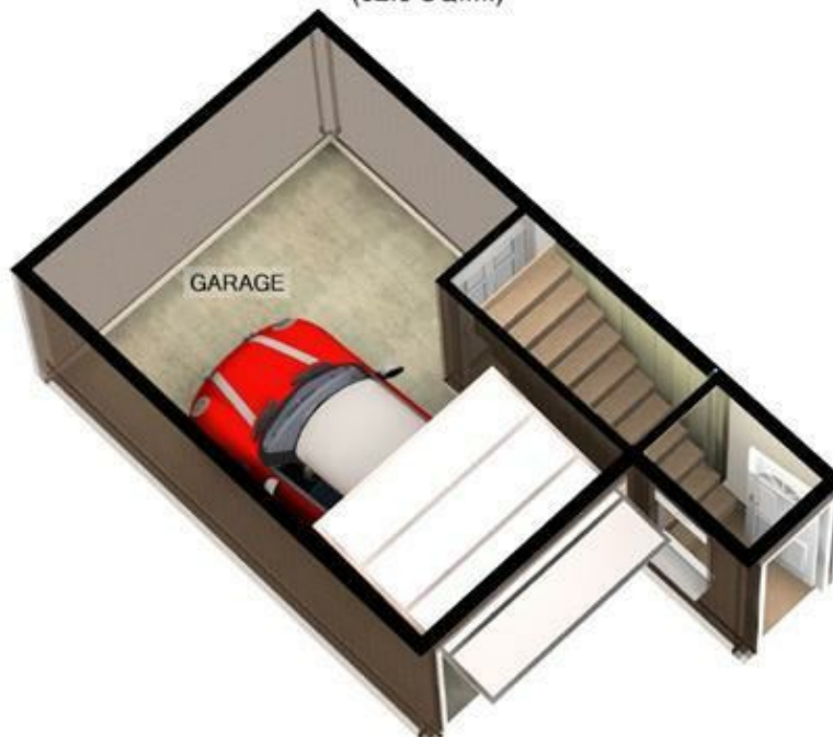
GROUND FLOOR APPROX. FLOOR AREA 248 SQ.FT. (23.1 SQ.M.)

TOTAL APPROX. FLOOR AREA 814 SQ.FT. (75.6 SQ.M.)