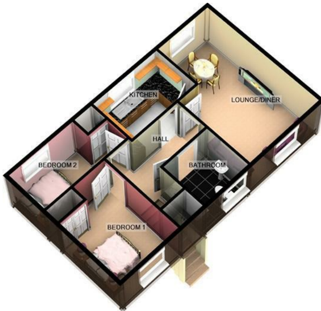
1ST FLOOR APPROX. FLOOR AREA 566 SQ.FT. (52.5 SQ.M.)