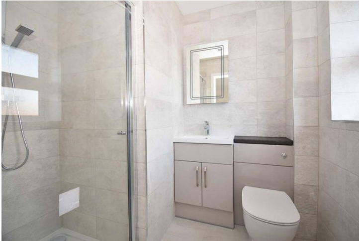
EXAMPLE OF FINISH (PLOT 1)