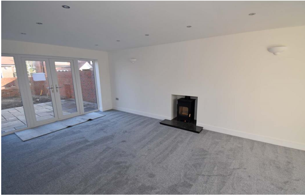
EXAMPLE OF FINISH (PLOT 1)