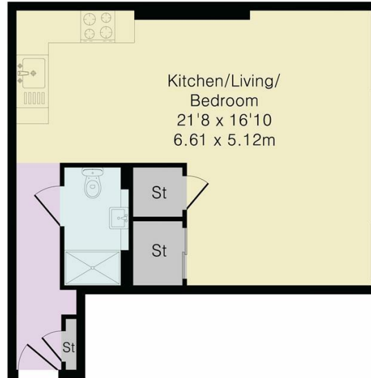
First Floor Flat