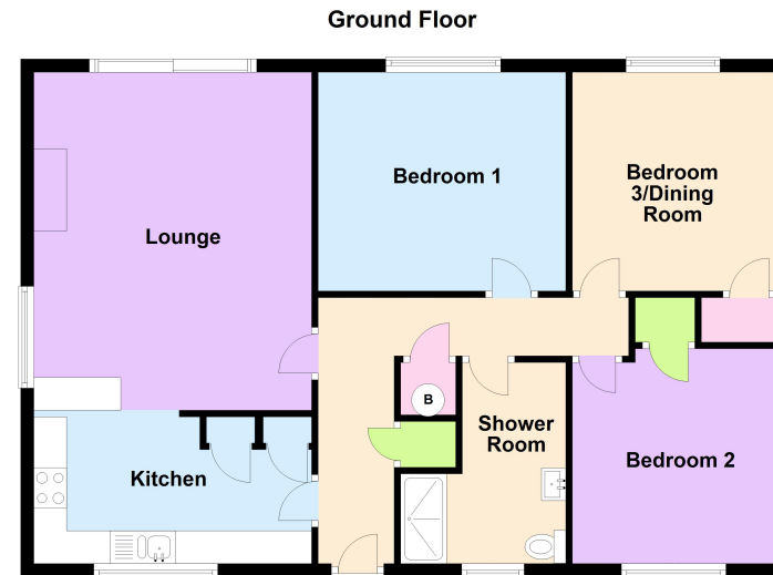
Produced by Poole Townsend Estates Ltd. Plan produced using PlanUp.

An immaculate and beautifully presented detached true bungalow, situated in a convenient and level location. The property benefits from well-proportioned accommodation on one level, complemented with surrounding low maintenance lawn and patio gardens. Internal viewing is advised.