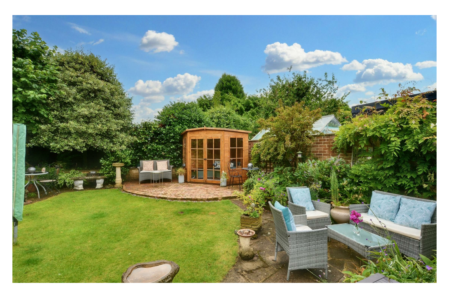
THIS GABLE FRONTED CHALET STYLE DETACHED PROPERTY IS SITUATED IN A SOUGHT AFTER RESIDENTIAL LOCATION CLOSE TO MANY LOCAL AMENITIES AND WITHIN EASY REACH OF ALL THOSE PROVIDED BY LONG EATON.

Robert Ellis are extremely pleased to bring to the market this TWO/THREE BEDROOM detached property which will provide an ideal family home. The property has been extended and improved by the current owner and derives the benefit of modern conveniences such as re-fitted GAS CENTRAL HEATING and DOUBLE GLAZING. Having been extended and improved by the current owners to create a larger open plan living/dining kitchen along with a shower room to the ground floor and bathroom to the first floor. To fully appreciate the size and quality of the accommodation on offer, a viewing comes highly recommended. The property offers extremely well proportioned accommodation being situated on Shirley Street and has a number of similar quality properties on what is one of the most sought after roads within Sawley.