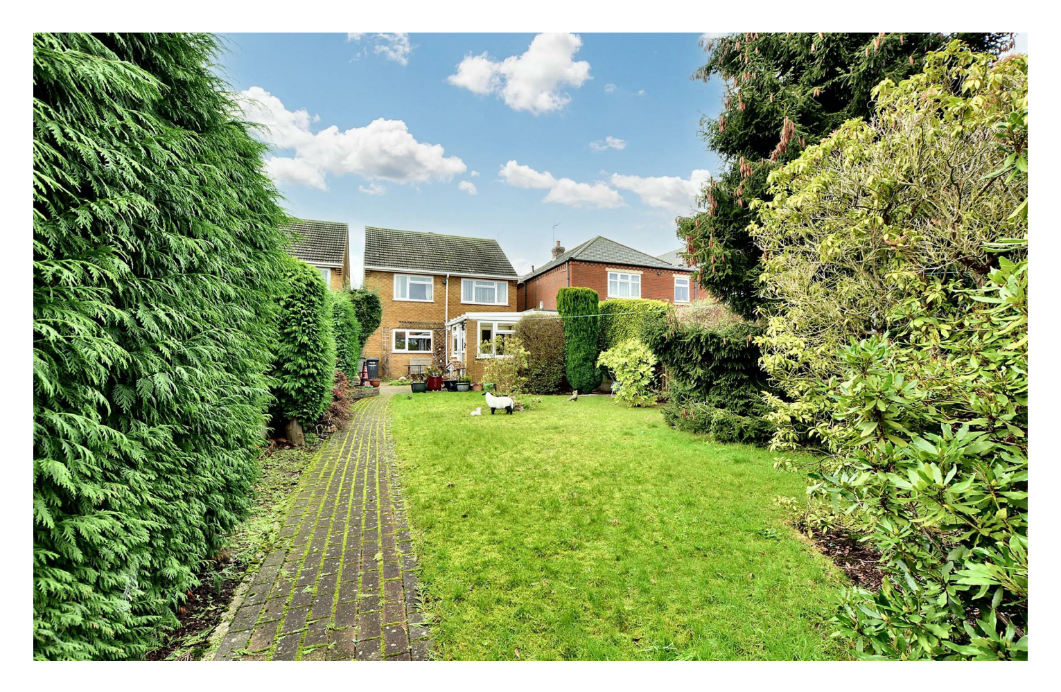
A FOUR BEDROOM DETACHED FAMILY HOME WITH OFF STREET PARKING, GARAGE AND A LARGE REAR GARDEN.

Robert Ellis are delighted to bring to the market this spacious and well presented detached family home. The property benefits from gas central heating and double glazing throughout and would suit a range of buyers including the growing family. An internal viewing is highly recommended to appreciate the property, location and size of the accommodation on offer.