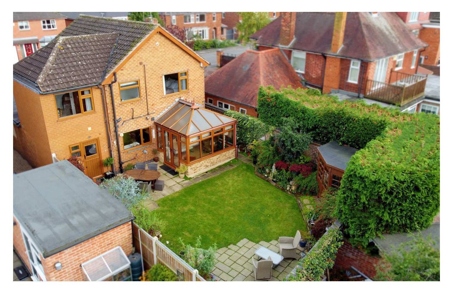
BEING SITUATED ON A VERY POPULAR ROAD IN BREASTON, THIS EXTENDED PROPERTY PROVIDES FOUR BEDROOM AND SPACIOUS GROUND FLOOR LIVING ACCOMMODATION.

Being located on Maylands Avenue, this individual detached property provides a lovely family home which we are sure will suit people who are looking to purchase a four bedroom property in the Breaston area. For the size of the accommodation and privacy of the rear garden to be appreciated, we recommend that interested parties do take a full inspection so they can see all that is included in this lovely home for themselves. The property is well placed for all the local amenities and facilities provided by Breaston village and is also only a mile away from J25 of the M1 and close to other excellent transport links.