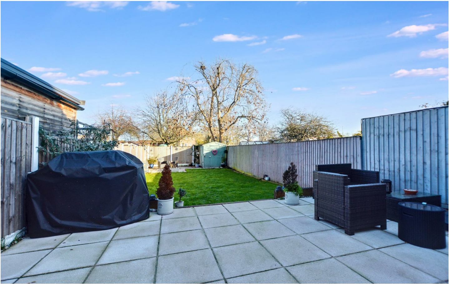
AN EXTENDED THREE BEDROOM SEMI DETACHED HOUSE OFFERING IMMACULATLY PRESENTED AND SPACIOUS ACCOMMODATION.

Robert Ellis are delighted to bring to the market this spacious and extremely well presented three bedroom semi detached house found in the popular and desirable location of Toton with easy reach to all the amenities and facilities and located for access to Long Eaton, Beeston and Stapleford town centres. There is also great access links to the A52 and M1 road networks along with the Toton tram system. This delightful home has been extended to the rear which opens the kitchen and dining room into one with sky lights and impressive outlook to the rear garden. This lovely home is ready for immediate occupation and for all that is included to be appreciated we strongly recommend that interested parties take a full inspection so they can see the whole property for themselves.