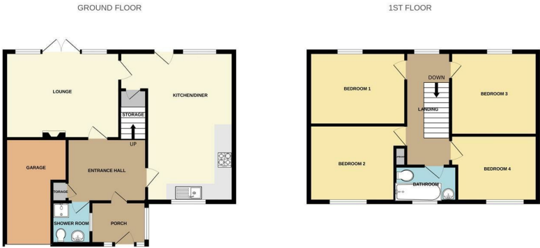
8 BELMONT DRIVE, BORROWASH

Whilst every attempt has been made to ensure the accuracy of the description contained here, measurements of doors, windows, rooms and any other items are approximate and no responsibility is taken for any error, omission or mis-statement. This plan is for illustrative purposes only and should be used as such by any prospective purchaser. The services, systems and appliances shown have not been tested and no guarantee as to their operability or efficiency can be given. Made with Metagix C2023