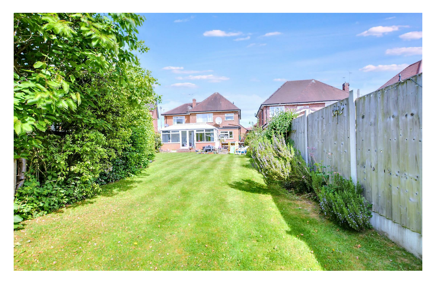
A SPACIOUS AND WELL PRESENTED FOUR DOUBLE BEDROOM DETACHED FAMILY HOME FOUND ON THIS SOUGHT AFTER ROAD, OVERLOOKING WEST PARK AND WITH AMPLE OFF STREET PARKING.

Robert Ellis are extremely pleased to be instructed to market this superb example of a detached family home. The property is constructed of brick to the external elevations and benefits from double glazing and gas central heating from a brand new combi boiler, which can be operated from a smart Hive system. An internal viewing is highly recommended to appreciate the property and location on offer.