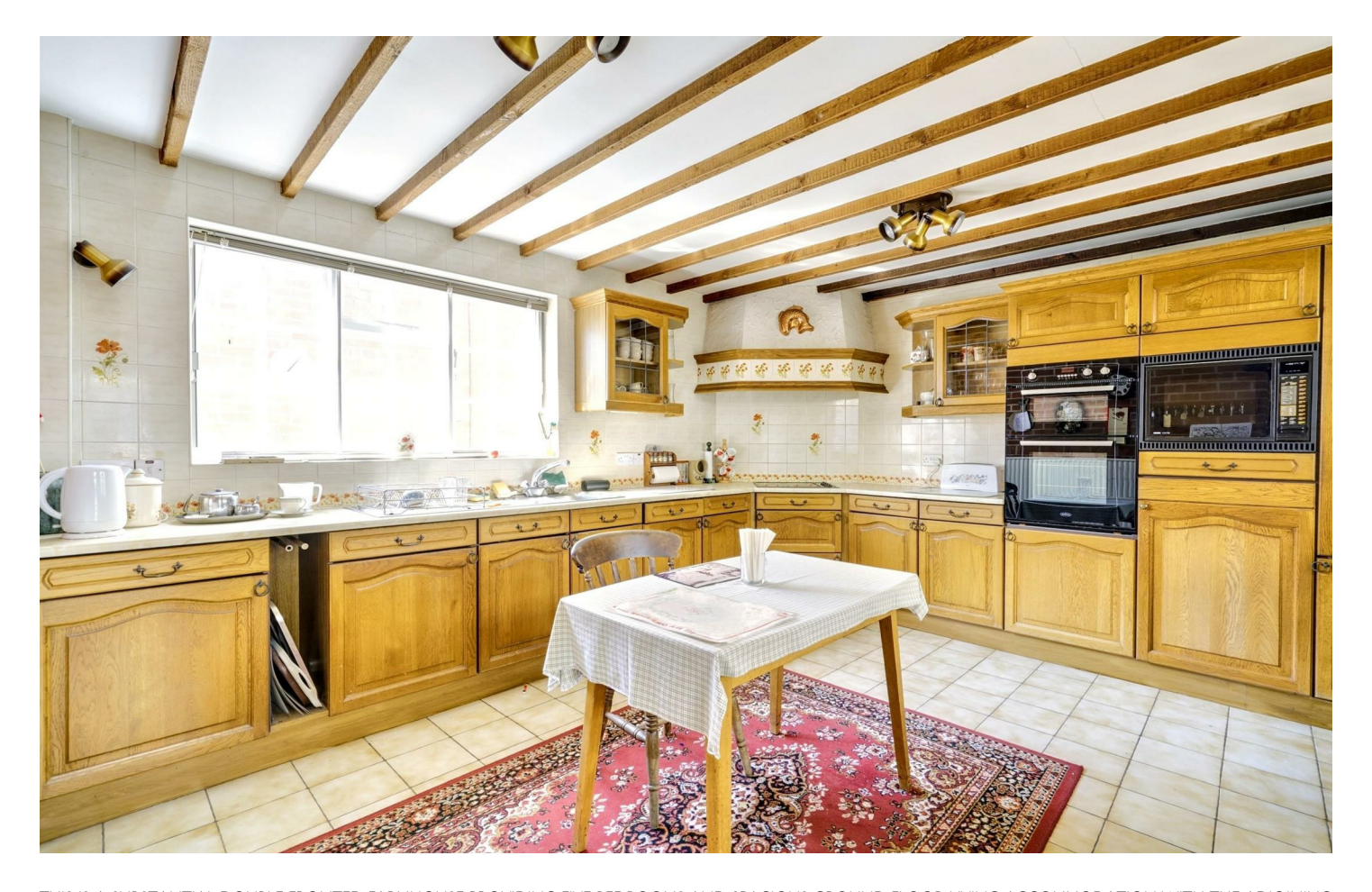
THIS IS A SUBSTANTIAL DOUBLE FRONTED FARMHOUSE PROVIDING FIVE BEDROOMS AND SPACIOUS GROUND FLOOR LIVING ACCOMMODATION WITH THE ADJOINING OUTBUILDINGS BEING OCCUPIED BY AN ESTABLISHED PRECISION ENGINEERING BUSINESS.

Robert Ellis are pleased to be instructed to market this mixed use property which includes a large farmhouse and outbuildings that are used by an established engineering business. The house is currently vacant and does require certain updating works but is ready to move into and the outbuildings are let to an established Engineering business – for which details of the rent paid and lease can be provided. The whole property is set in approx. 2.5 acres of land with there being parking for between 20-30 vehicles on the land adjacent to the Engineering business. The main house is currently vacant and is being sold with the benefit of NO UPWARD CHAIN and if prospective buyers are interested in occupying the farmhouse as a home and having an adjoining building as an investment or at a later stage for their own use, we would be pleased to arrange a viewing.