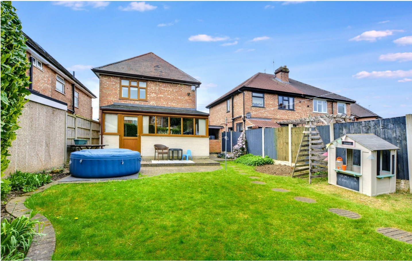
A BEAUTIFULLY PRESENTED THREE BEDROOM DETACHED HOUSE WITH IDEAL OPEN PLAN KITCHEN DINER AND FAMILY ROOM WITH GARAGE, DRIVE AND GARDEN.

Located in the heart of Sawley on a quiet sought after road, this superb property has great transport links and is within walking distance of Trent Lock, Long Eaton train station, shops and great schools for all ages. Retaining many original features such as balustrade staircase and picture rails, the property offers a warm and cosy feeling and also benefits from a bay-fronted lounge. There is the added benefit of a driveway to the front with a brick built garage to the side with power and lighting. The property would suit a range of buyers from people looking to upsize with the second reception room which is open to the kitchen diner. Sawley is a sought after residential area with schools for younger children, a variety of shops and walks in the surrounding countryside. An internal viewing is highly recommended to appreciate all that is in offer!