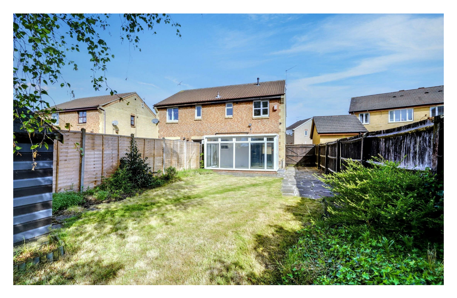
THIS IS A THREE BEDROOM SEMI DETACHED PROPERTY LOCATED ON A QUIET CUL-DE-SAC CLOSE TO EXCELLENT LOCAL SCHOOLS AND TRANSPORT LINKS.

This three bedroom semi detached house provides a lovely home which will suit a whole range of buyers, from people buying their first property through to families who are looking for a three bedroom home which is close to excellent local schools and other amenities and facilities. The property is being sold with the benefit of NO UPWARD CHAIN and is therefore ready for immediate occupation by a new owner and for the size and layout of the accommodation and the privacy of the rear garden to be appreciated, we recommend that interested parties take a full inspection so they can see all that is included in this lovely home for themselves.