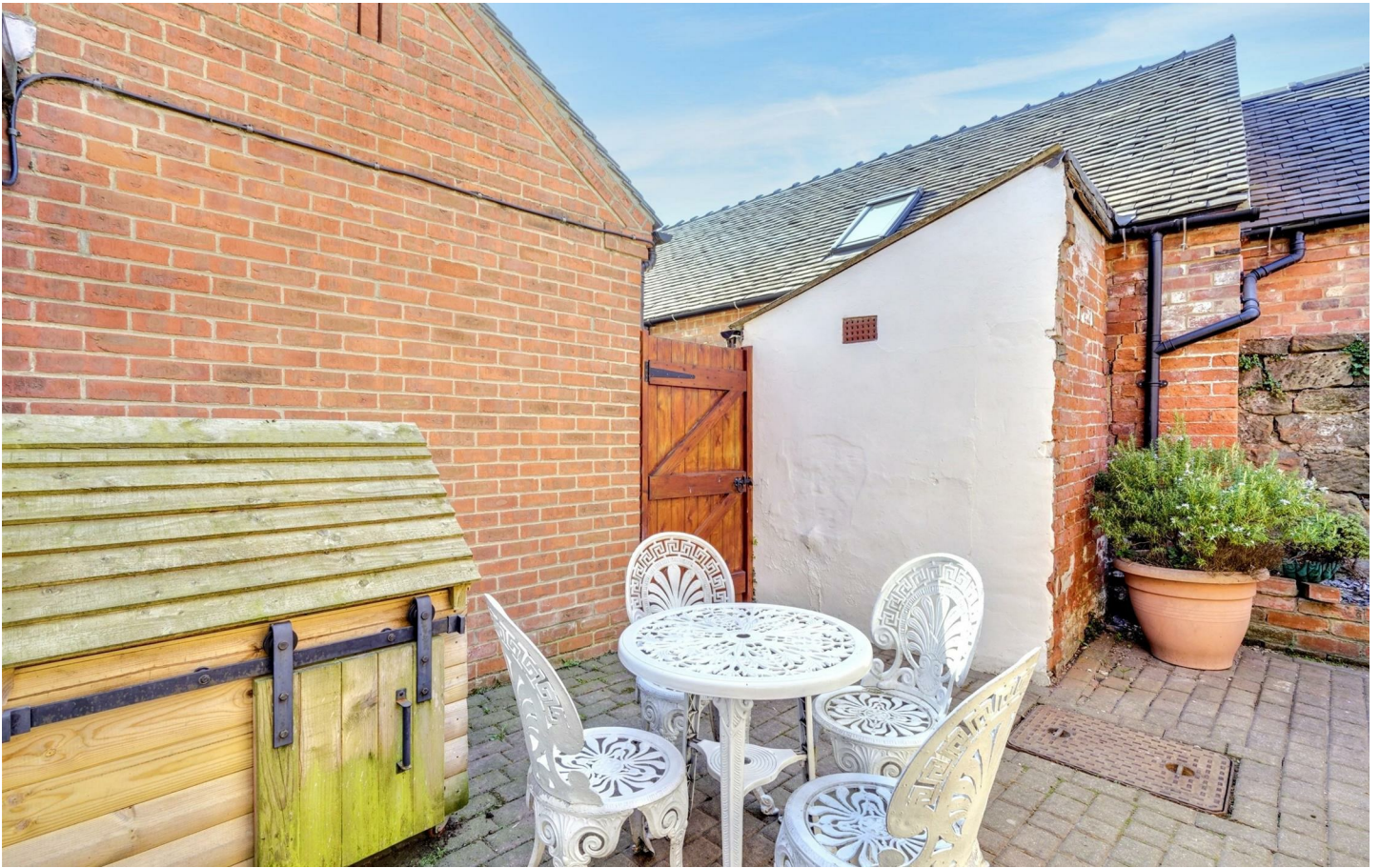
A BEAUTIFUL COTTAGE CURRENTLY USED AS A HOLIDAY LET SITUATED IN A PICTURESQUE RURAL LOCATION, BUT STILL BEING ACCESSIBLE TO SHOPS AND OTHER AMENITIES AND FACILITIES AND TO EXCELLENT TRANSPORT LINKS.

We are very pleased to be asked to market this two bedroom quirky character cottage which we believe dates back to the 1850's and provides a home which has a cosy feel and at the front overlooks open fields and farm land. Used as a holiday let on The property has been upgraded throughout with a new kitchen and bathroom having been fitted, but still retaining its character with original beams and internal doors and for all that is included to be appreciated, we strongly recommend that interested parties do take a full inspection so they are able to see the whole property for themselves. The property has recently had a log burning stove incorporated in the brick chimney breast in the lounge which is positioned to the front of the cottage and this helps to provide a warm feeling throughout the cottage and helps to add to the charm and character. We feel the property will be of interest to a whole range of buyers, from those buying their first home to people who might be downsizing from a larger property and are in search of a cottage style property they can move in to without having to do any work whatsoever. Or someone looking for an ideal holiday let which is ready to go!