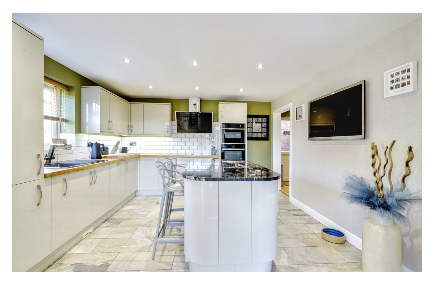
THIS IS A BEAUTIFUL DETACHED FAMILY HOME SITUATED AT THE HEAD OF A QUIET CUL-DE-SAC WHICH INCLUDES SPACIOUS GROUND FLOOR LIVING ACCOMMODATION AND FIVE DOUBLE BEDROOMS AND A SEPARATE STUDIO ANNEX.

Robert Ellis are pleased to be instructed to market this substantial five or even six bedroom detached property which is situated in this most sought after area within Breaston village. The property was constructed approx. I4 years ago and is part of a prestigious development of similar properties. Since being originally built the property has been extended at the rear and had the annex created above the garage and for all that is included to be appreciated, we recommend that interested parties take a full inspection so they are able to see the whole property for themselves. Breaston village has a number of local amenities including schools for younger children and shops, while Long Eaton is only a short drive away where there are schools for older children and many other shopping facilities.