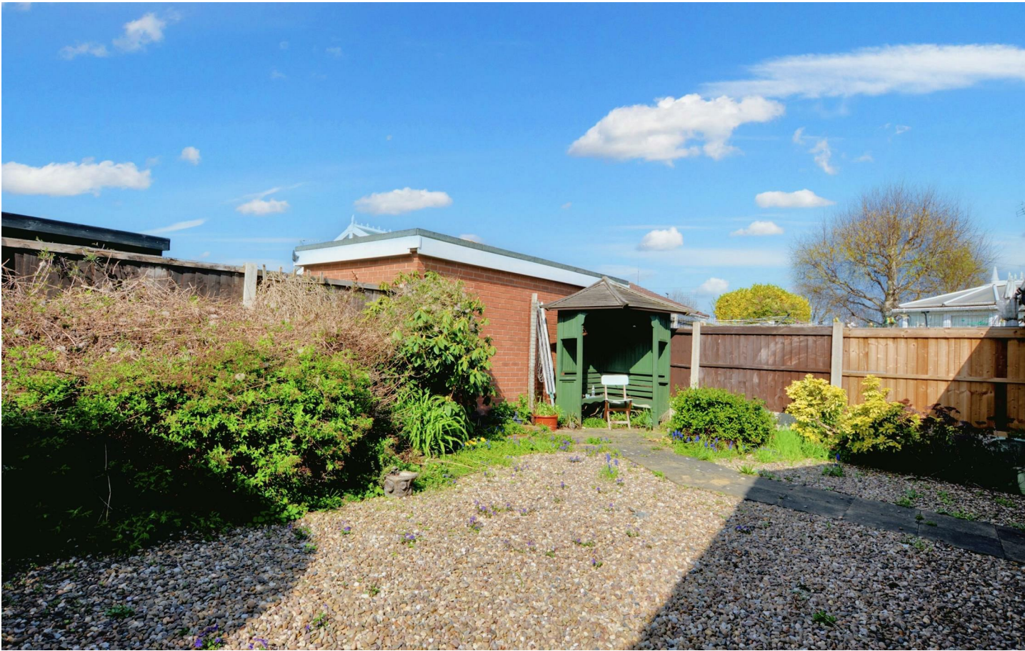
THIS IS A TWO BEDROOM DETACHED BUNGALOW POSITIONED ON A LARGE PLOT WITH A GARAGE.

Robert Ellis are delighted to offer to the market this detached bungalow situated in this popular part of Long Eaton on Quantock Road. The property stands fantastically well from the front aspect and has a beautifully lawned front garden with access via a driveway to the single garage, front door and rear garden.