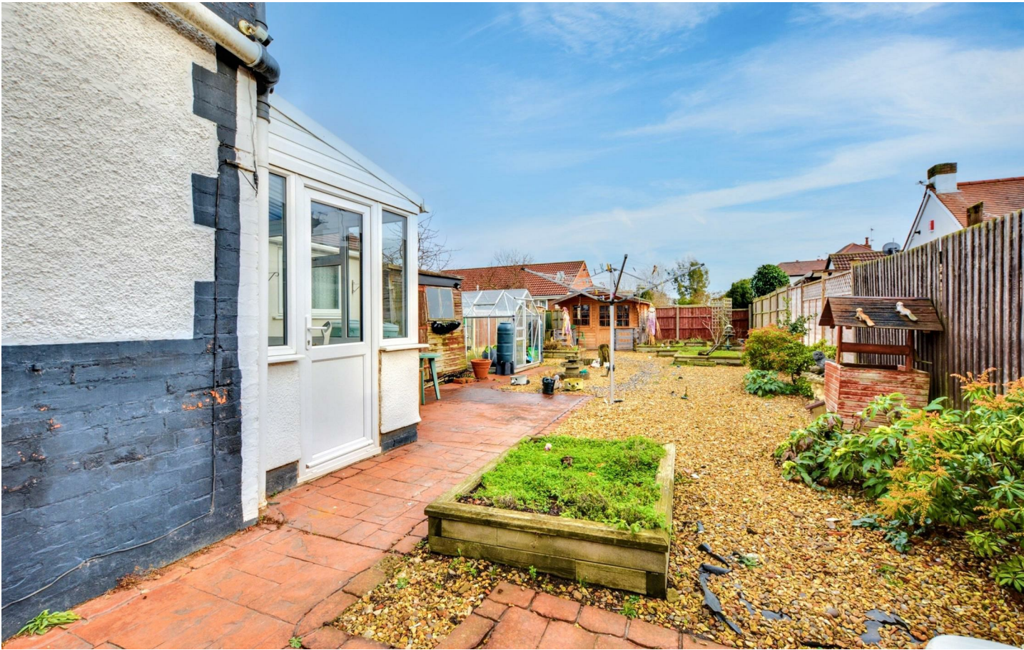
THIS IS A TRADITIONAL BAY FRONTED SEMI DETACHED HOME WHICH HAS THE POTENTIAL TO EXTEND AND UPGRADE, SITUATED ON A LARGE PLOT IN THIS MOST SOUGHT AFTER RESIDENTIAL AREA.

Being located on Carrfield Avenue, this traditional bay fronted property provides a lovely home that has the potential for a new owner to stamp their own mark on their next property as it has space at the side and rear to be significantly extend, if this was required by a new owner. For the size of the plot and layout of the accommodation to be appreciated, we recommend that interested parties take a full inspection so they can see all that is included in this lovely home for themselves. The property is well placed for excellent local schools, which have been one of the main reasons why people have wanted to move to the Toton area over the past couple of decades and to excellent transport links which includes the latest extension for the Nottingham tram system, all of which have helped to make this a popular and convenient place to live.