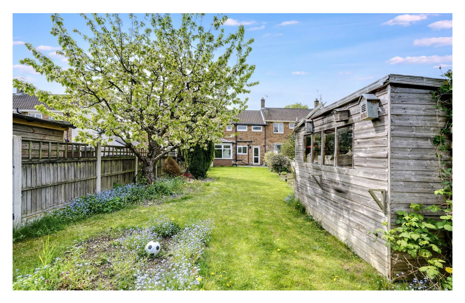
A WELL PRESENTED AND SPACIOUS, THREE BEDROOM MID-TERRACED HOUSE WITH AMPLE OFF STREET PARKING AND AN ENCLOSED REAR GARDEN, PERFECT FOR A WIDE RANGE OF BUYERS AND SITUATED WITHIN THE POPULAR AREA OF TOTON.

Robert Ellis are delighted to be instructed to bring to the market this superb example of a three bedroom mid-terraced property situated within the heart of Toton, close to a wide range of amenities and boasting two reception rooms with ample off street parking to the front. The property is constructed of brick to the external elevations and benefits double glazing and gas central heating throughout. This would make a fantastic home for a wide range of buyers and an internal viewing is highly recommended to appreciate the property and location on offer.