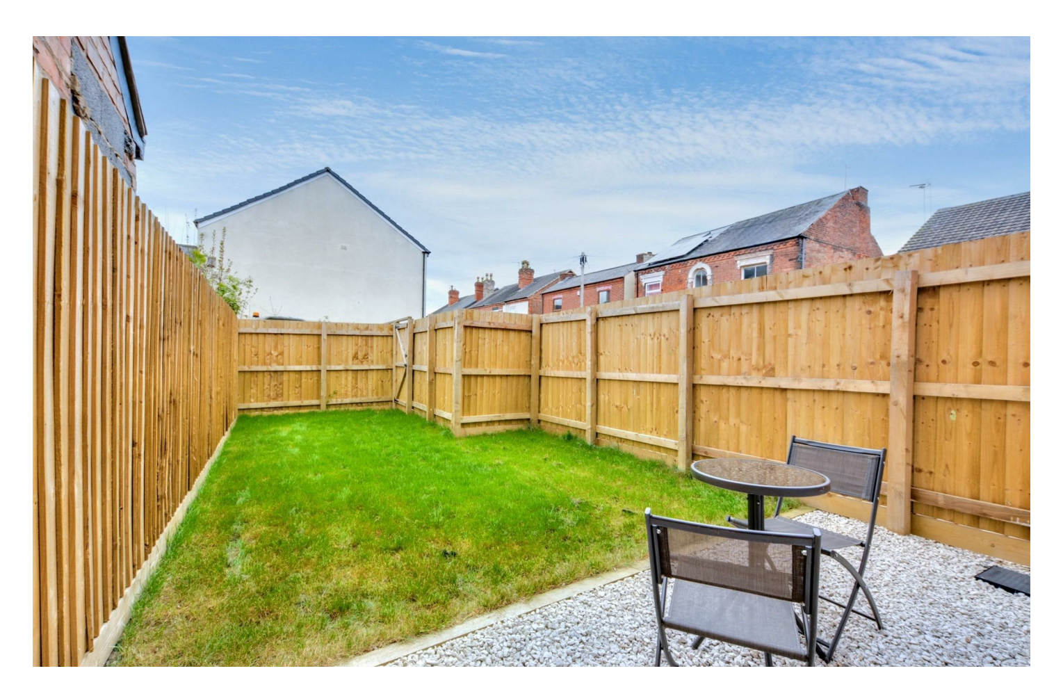
THIS IS A BRAND NEW FOUR DOUBLE BEDROOM PROPERTY WHICH ALSO HAS THREE SHOWER ROOMS AND SPACIOUS GROUND FLOOR LIVING ACCOMMODATION.

Robert Ellis are pleased to be instructed to market this brand new four bedroom semi detached home which is unique in as much as it has three shower rooms and a ground floor w.c. The property is highly appointed throughout with carpeting and LVT flooring and for the size of the accommodation which is arranged on three levels and the privacy of the rear garden to be appreciated, we recommend that interested parties take a full inspection so they can see all that is included in this lovely home for themselves.