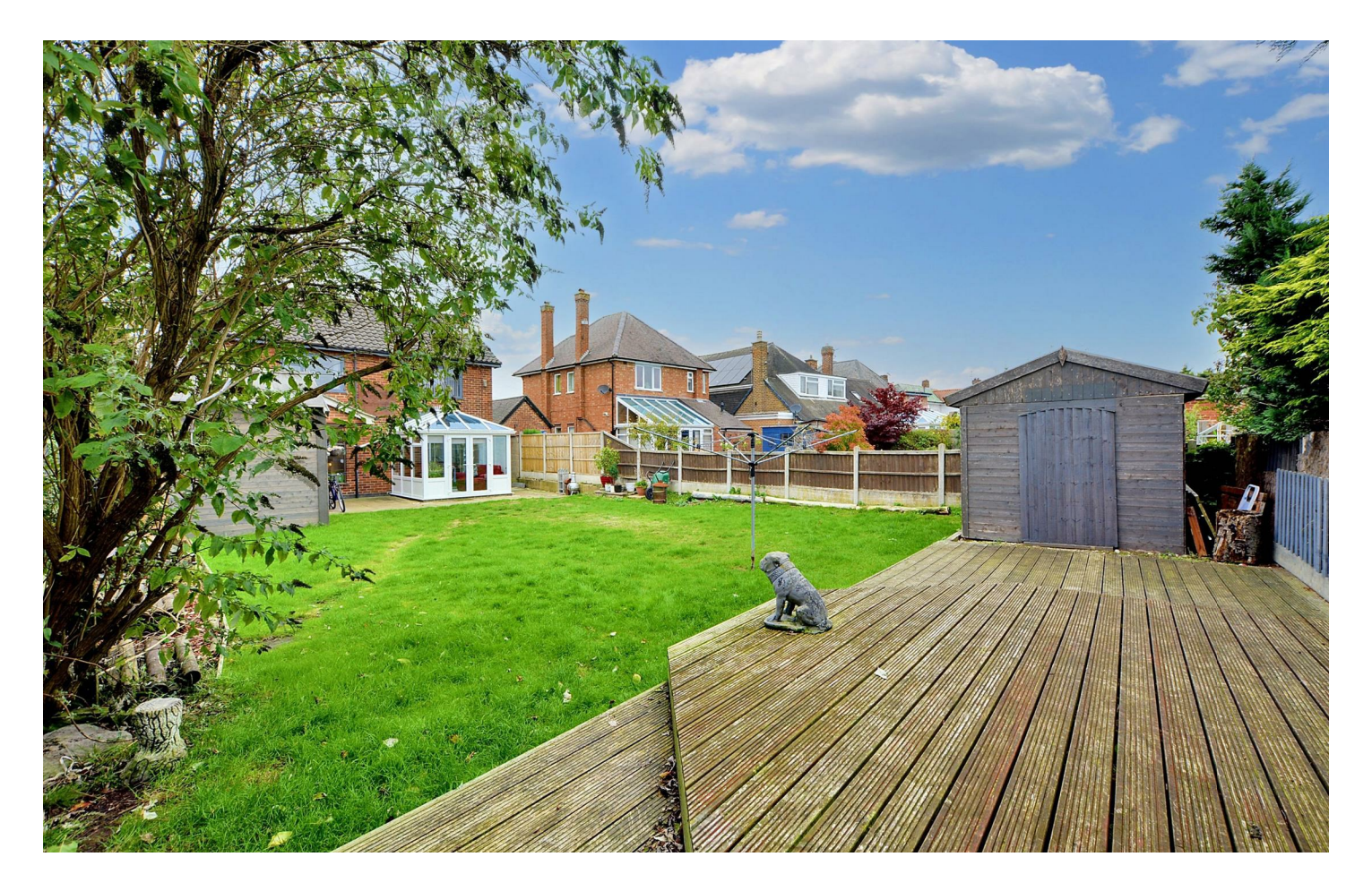
A SUPERB EXAMPLE OF A THREE/FOUR BEDROOM DETACHED FAMILY HOME WITH OFF STREET PARKING AND LARGE ENCLOSED REAR GARDEN SITUATED WITHIN THIS SOUGHT AFTER LOCATION.

Robert Ellis are delighted to be instructed to market this fantastic example of a generously sized three/four bedroom detached family home offering versatile accommodation throughout. There is off street parking to the front with a large and enclosed garden to the rear. The property is constructed of brick to the external elevations and benefits double glazing and gas central heating throughout with a brick built garage and bar to the rear. This would make a fantastic home for the growing family looking for fantastic school catchments and transport links. An internal viewing is highly recommended to appreciate the property and location on offer.