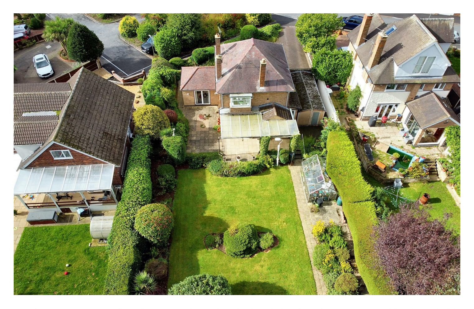
THIS IS AN EXTENDED THREE BEDROOM DETACHED FAMILY HOME WHICH IS POSITIONED ON A LARGE, PRIVATE PLOT IN THE PRESTIGIOUS PARKSIDE AREA OF LONG EATON.

Robert Ellis are pleased to be instructed to market this detached family home which since being originally constructed, has been extended to the side and rear which has enlarged the ground floor living accommodation. The property is positioned on one of the largest plots in the Parkside area of Long Eaton and for the size and privacy of the gardens as well as the size of the accommodation included to be appreciated, we do recommend that interested parties take a full inspection so they can see all that is included in this lovely home for themselves. The property lends itself to be further extended and upgraded which is again something people will see when they view. The Parkside area of Long Eaton is one of the most sought after areas in which to live and is close to excellent local schools, is only a short drive away from the town centre and is also within easy reach of excellent transport links, all of which have helped to make this a very popular and convenient place to live.