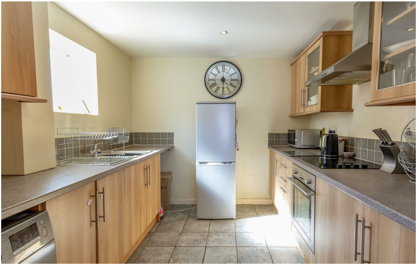
A FIRST FLOOR APARTMENT AT 'THE OLD BANK DWELLING' SITUATED IN THE HEART OF DRAYCOTT.

Robert Ellis are delighted to bring to the market a two double bedroom first floor duplex apartment which is ideal for rental/investment property with current tenant in situ and potential rent of £950 pcm. Also would suit the first time buyer or someone downsizing. The semi detached property has been converted into two apartments with the first floor apartment being on two floors and befitting from two double bedrooms, the master having an en-suite shower room on the top floor. It is very private having a gated entrance, original tiling to the porch and entrance hall and there are also steps down to a cellar, ideal for storage. There is free on road parking and you can also park on Elvaston Street. The road is also on a main bus route. An internal viewing is highly recommended to fully appreciate the accommodation on offer.