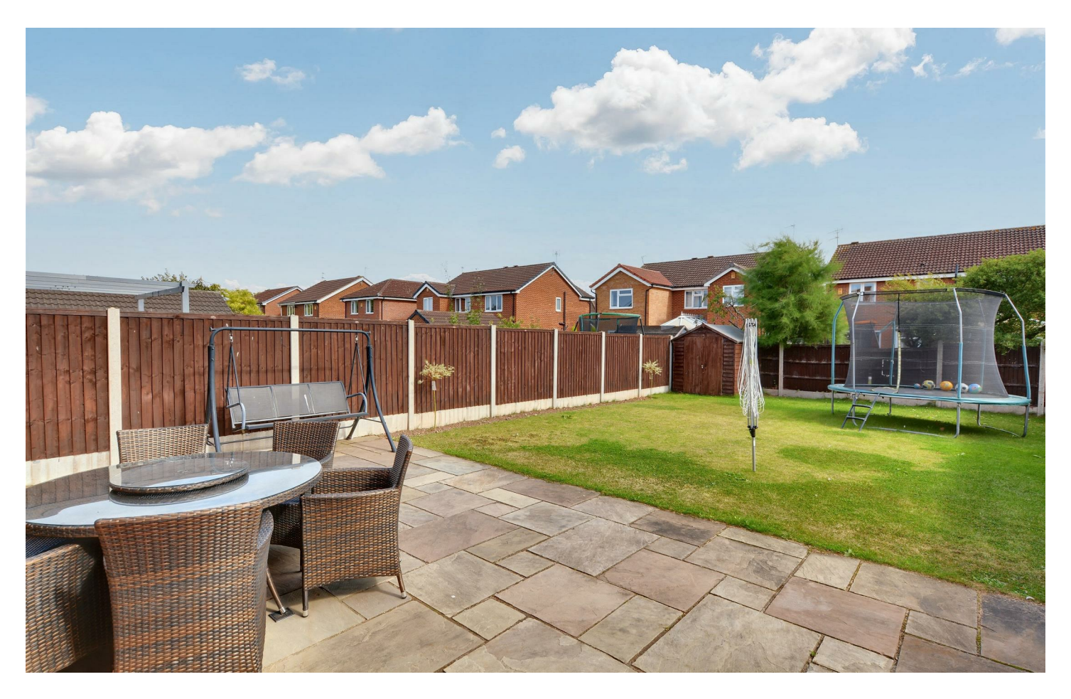
THIS IS A SPACIOUS FOUR BEDROOM DETACHED HOME SITUATED IN THIS MOST POPULAR RESIDENTIAL AREA ON THE OUTSKIRTS OF LONG EATON.

Being located on Bosworth Way, this recently constructed four bedroom detached property provides a lovely family home which is well placed for easy access to the amenities and facilities provided by Long Eaton and the surrounding area. The property benefits from having a large South facing garden at the rear and for all that is included in this lovely home to be appreciated, we recommend that interested parties take a full inspection so they can see the whole property for themselves.