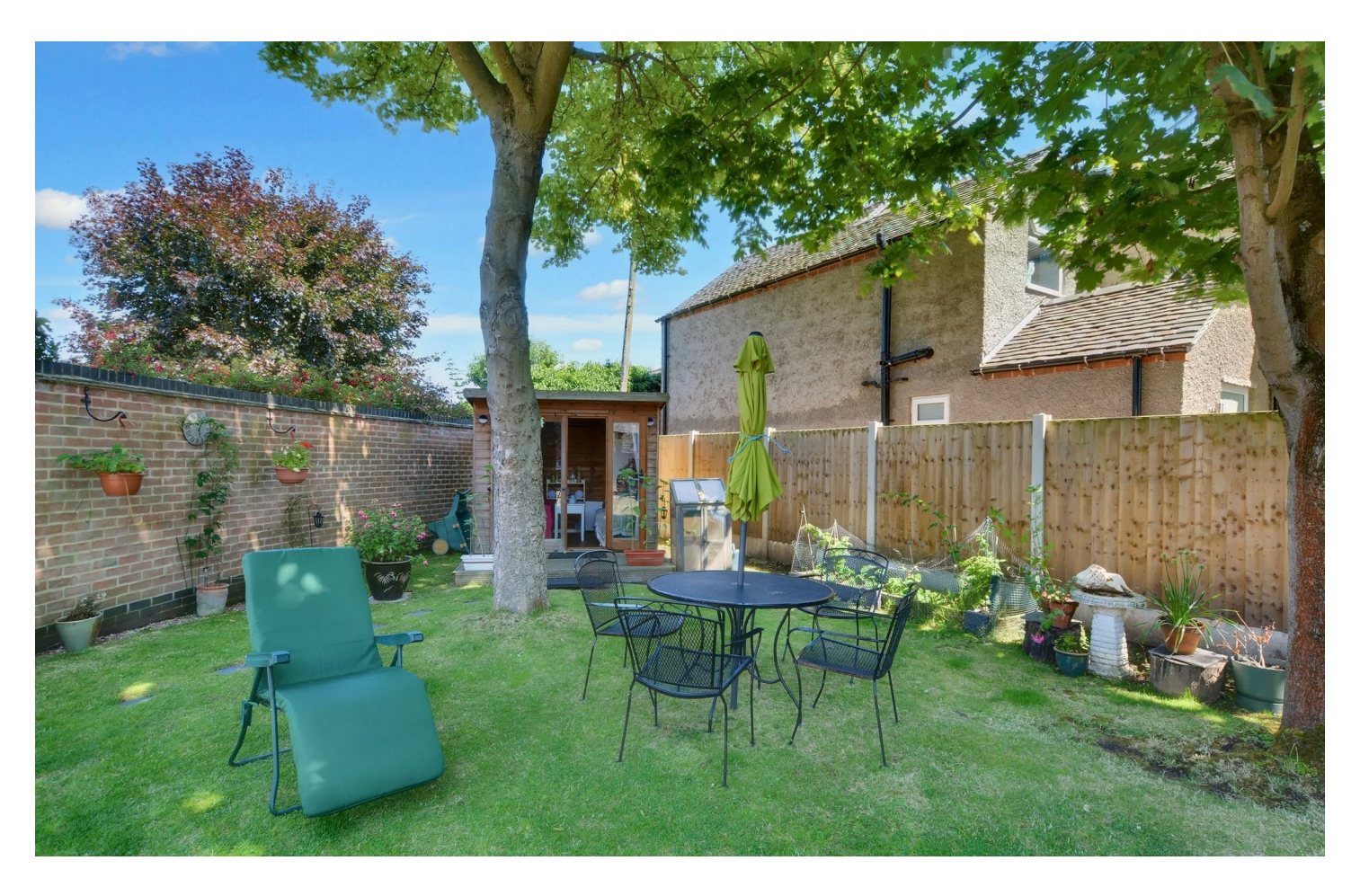
A THREE/FOUR BEDROOM PERIOD PROPERTY WITH THE ACCOMMODATION ARRANGED ON THREE LEVELS WHICH IS SITUATED IN THE HEART OF THIS MOST SOUGHT AFTER VILLAGE.

Being located on Weston Road, this period property offers spacious accommodation which will suit a whole range of buyers. The property is entered through double electronically operated gates to the right hand side and there is a shared block paved drive which serves two other properties. For the size and layout of the accommodation and privacy of the courtyard garden to be appreciated, we recommend that interested parties do take a full inspection so they are able to see for themselves all that is included in this beautiful home. The property is conveniently located with there being a local general store across the road, there are excellent local pubs and other facilities provided by Aston on Trent, with other towns being within easy reach.