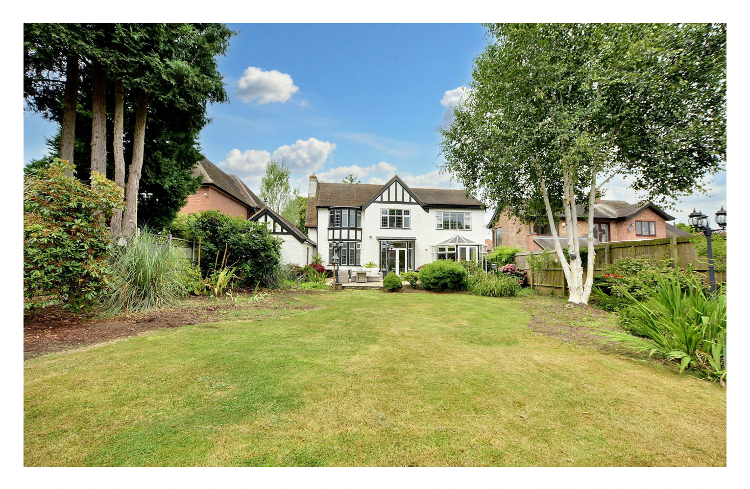
THIS IS A SUBSTANTIAL INDIVIDUAL DETACHED FAMILY HOME WHICH INCLUDES EXTENSIVE GROUND FLOOR LIVING ACCOMMODATION AND FOUR DOUBLE BEDROOMS WITH BEAUTIFUL SOUTH FACING GARDENS TO THE REAR.

Robert Ellis are pleased to be instructed to market this individual detached home which is positioned within a few minutes walk of the centre of Breaston village. The property is being sold with the benefit of NO UPWARD CHAIN and for the size of the accommodation and the privacy and extent of the rear garden to be appreciated, we recommend that interested parties do take a full inspection so they can see all that is included in this beautiful home for themselves. Breaston village offers a number of local amenities including schools for younger children, shops and various pubs whilst there are excellent transport links within easy reach, all of which have helped to make this a very popular place to live.