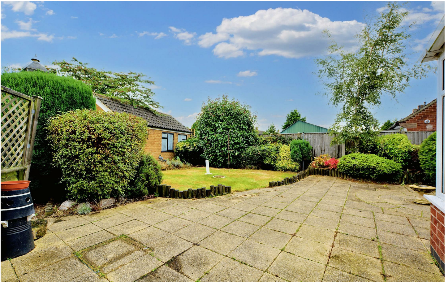
A TRADITIONAL THREE BEDROOM SEMI DETACHED HOUSE WHICH IS POSITIONED ON A LARGE PLOT WITH A DETACHED GARAGE AND GARDENS TO THREE SIDES.

Being situated at the end of Wilmot Street, this three bedroom semi detached home is ready for immediate occupation and over the years has been well appointed throughout, as people will see when they take an internal inspection. The property stands on a large plot and we believe there might be the potential to create a building plot to the left hand side of the house, but this is something a new owner would have to investigate after they have purchased the property. The property is being sold with NO UPWARD CHAIN and with little, if any work, is ready for a new owner to take immediate occupation. The house is well positioned for the local amenities and facilities provided by Sawley which includes the Co-op convenience store on Draycott Road and schools for younger children, with Long Eaton also being within easy reach where there are many more amenities and facilities provided.