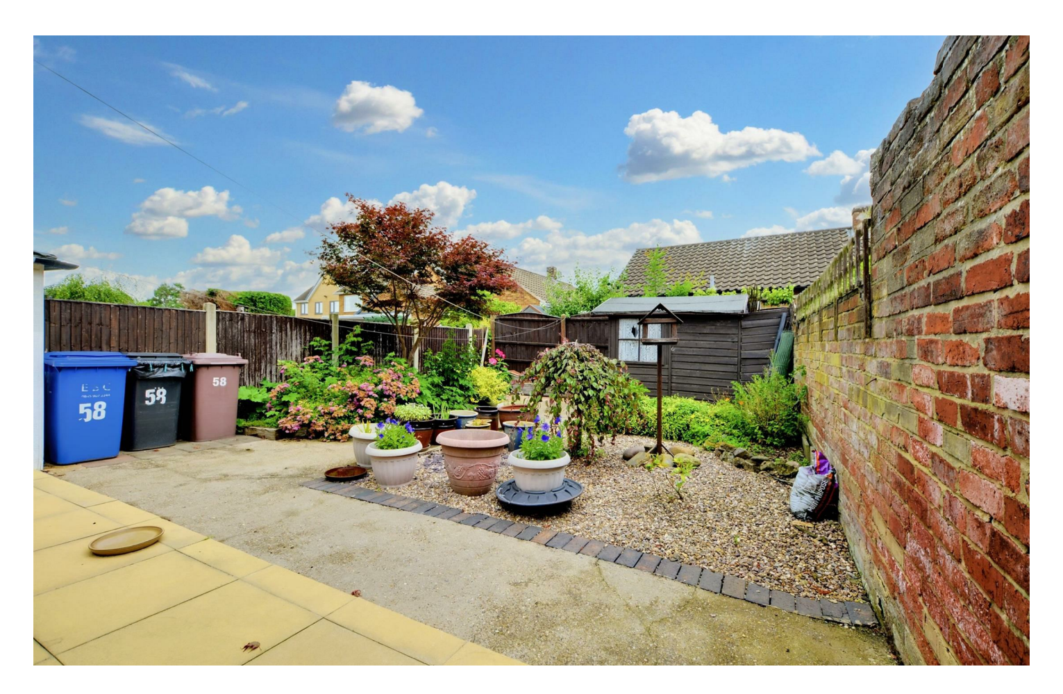
THIS IS A LARGE FOUR BEDROOM DETACHED FAMILY HOME WHICH IS WITHIN A FEW MINUTES WALK OF LONG EATON TRAIN STATION AND CLOSE TO THE MANY OTHER AMENITIES AND FACILITIES PROVIDED BY THE AREA.

Being located at the bottom of Hey Street in Sawley, this four bedroom detached property provides a lovely family home which is close to excellent local amenities and facilities and transport links. For the size of the accommodation and privacy of the rear garden to be appreciated, we recommend that interested parties do take a full inspection so they can see all that is included in this lovely home for themselves.