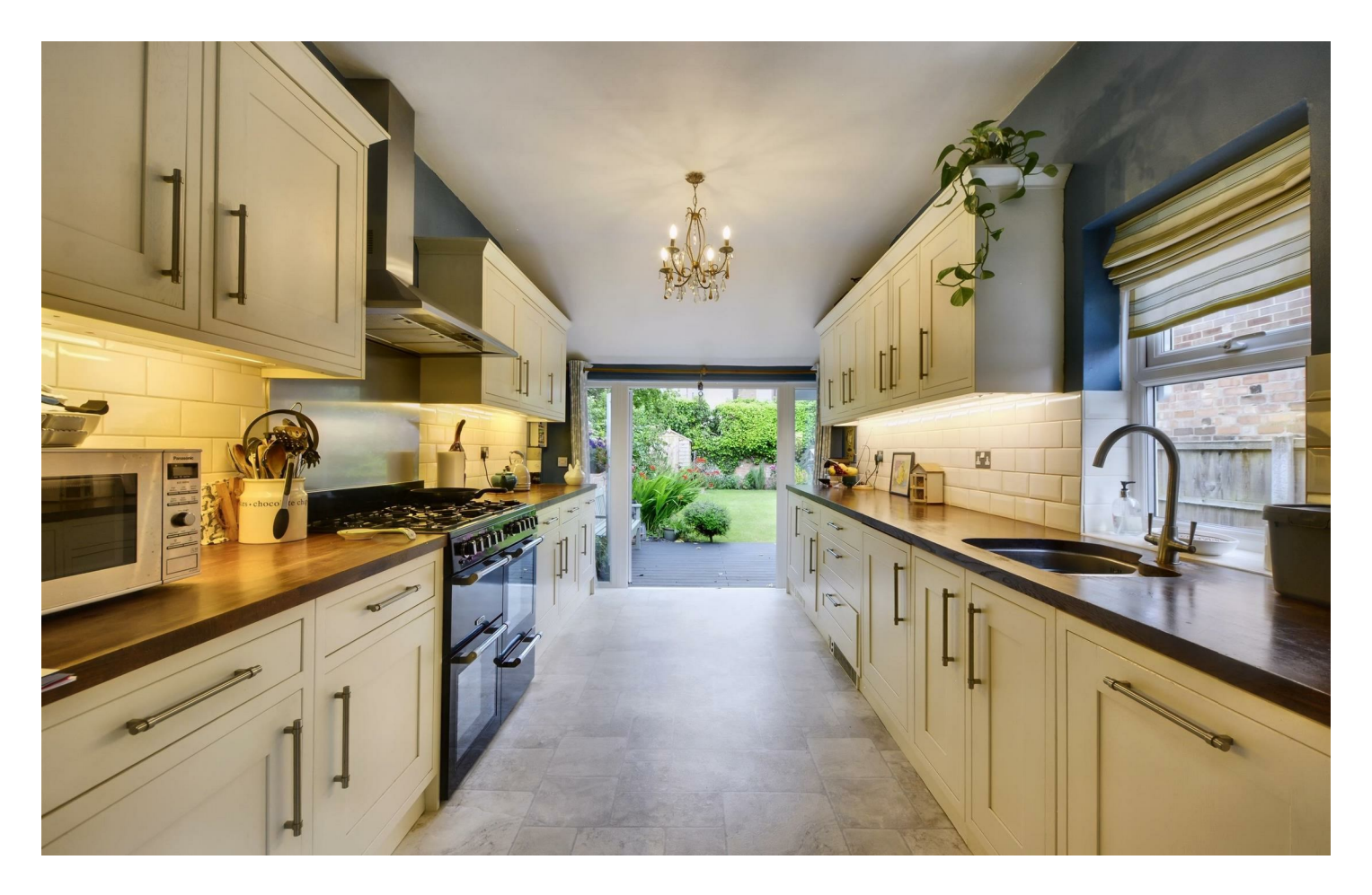
THIS IS A FOUR BEDROOM EDWARDIAN DETACHED HOME SITUATED IN THIS ESTABLISHED RESIDENTIAL AREA WHICH IS WITHIN EASY WALKING DISTANCE TO EXCELLENT LOCAL SCHOOLS AND OTHER AMENITIES AND FACILITIES PROVIDED BY THE AREA.

Robert Ellis are pleased to be instructed to market this four bedroom detached Edwardian home which provides light and airy accommodation arranged on three levels with the property still retaining many original features. For the size and layout of the accommodation to be appreciated, we do recommend that interested parties take a full inspection so that they can see the layout and size of the accommodation and privacy of the landscaped rear garden for themselves. The property is within easy reach of excellent local schools which include Trent College and the Wilsthorpe Academy, and there are many other local amenities and facilities, and excellent transport links, all of which have helped to make this a very popular and convenient place to live.