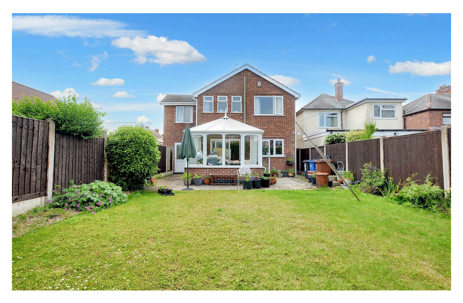
A GABLE FRONTED AND EXTENDED DETACHED HOUSE PROVIDING SPACIOUS ACCOMMODATION AND FOUR/FIVE GOOD SIZE BEDROOMS WITH GARAGE AND DRIVEWAY